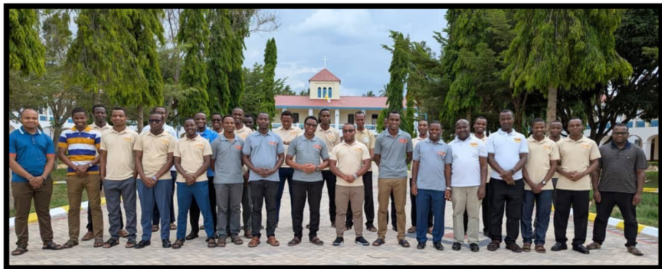
Above: The Seminarians of the Catholic Diocese of Moshi from St. Paul the Apostle - Kipalapala Seminary.