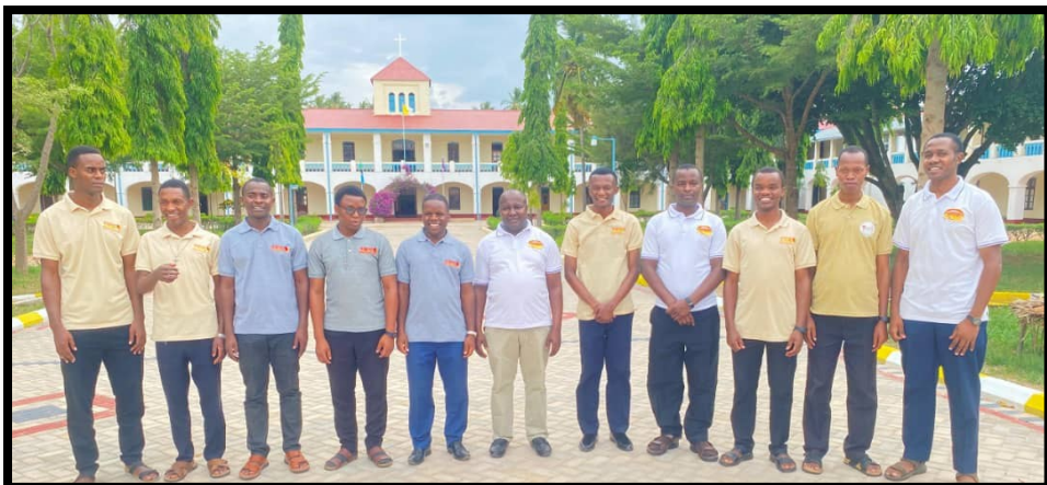
Below: This photo was taken on the Solemnity of Our Lord Jesus Christ, King of the Universe, who is the Patron and Intercessor of the Catholic Diocese of Moshi. 4 th Year Theology