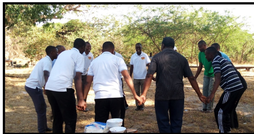
First Year Students are welcomed to Kipalapala Seminary