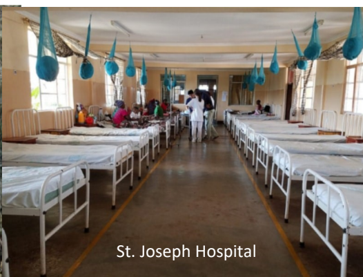
St. Joseph Hospital