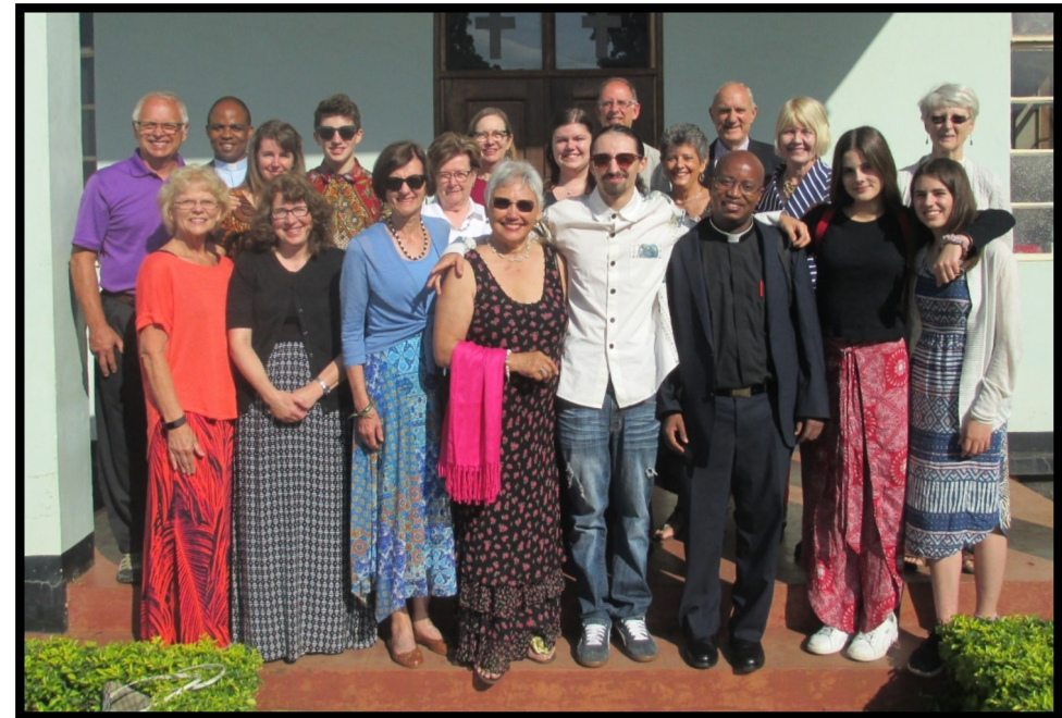
US visitors from Oregon, Arizona, Florida, Michigan, Alaska, New York and Ohio get ready to head to the Ordination Mass on July 6th. Will you be in next year's picture??