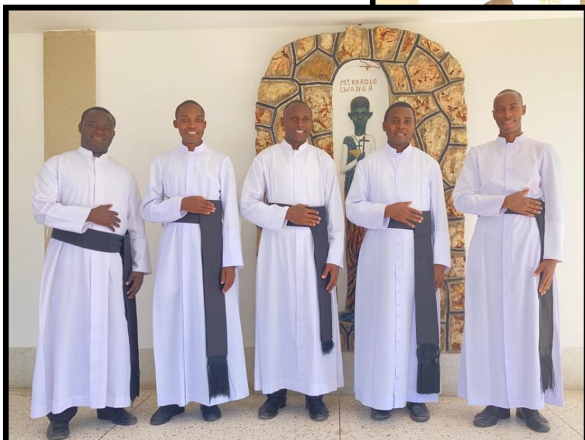
4th year Theology seminarians at Segerea Senior Seminary are happy to begin their Pastoral year this fall.