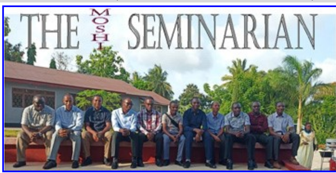
4th Year Theology Seminarians at Segerea - Happy to participate in the diaconate ordination at Archdiocese of Dar es Salaam on 8th January 2022.